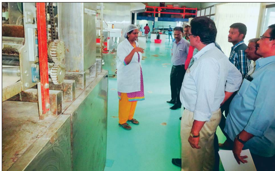
Visit to Millets incubation centre, PJTSAU