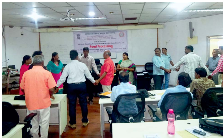
Ice breaking exercise

The programme was fabricated with sessions on Food processing in India, Processing technologies in fruits, vegetables, cereals and millets, Value addition to underutilized foods, Processing of functional foods and nutraceuticals, Opportunities in food processing, Post harvest technologies in food processing and Food safety aspects. Visits were arranged to millets incubation