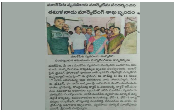
Press clippings of market yard visits to Malakpet (e-NAM) market and Bowenpally market