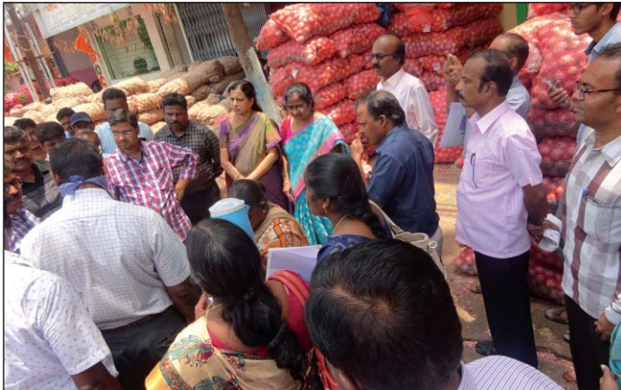
Participants interaction with traders at Malakpet

The programme was organized on consultancy basis in collaboration with SAMETI, Kudimianmalai, Tamilnadu under “Support to State Extension Programmes for Extension reforms Scheme”