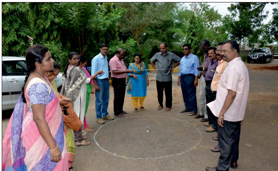
Ice breaking exercises

One of the most frequent concerns and complaints of people today is that they don't have enough time to do what they have to do. With the rapid pace of modern living, it feels increasingly difficult to keep up. The negative effects of poor time management is stress which is widespread and growing. Time management, when done effectively and thoughtfully, can help to reduce stress significantly. Time management methods involve finding ways to work more efficiently, so as to maximize one's use of time. A variety of techniques and tools for list-making, task analysis