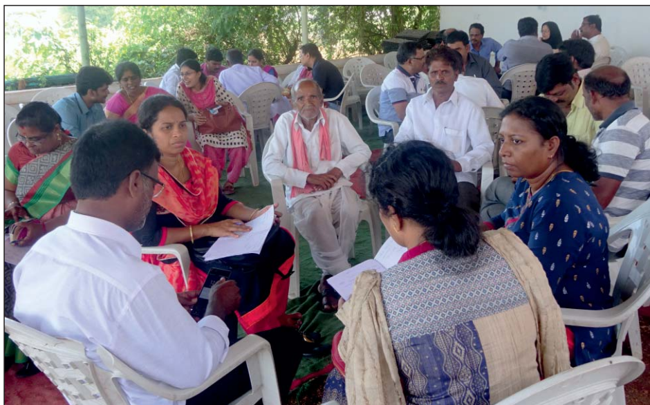
participants collected data from farmers of Kothagadi village

June 2018, said that all necessary steps shall be taken to improve lodging facilities for comfortable stay of the participants. Adding to the discussion he said “though all of us are doing remarkable extension work in fields it is seldom documented, this lacuna can be rectified by applying the skills learnt in this training”. He expressed his happiness when one of the participants indicated that this training improved her behavioural traits such as confidence in