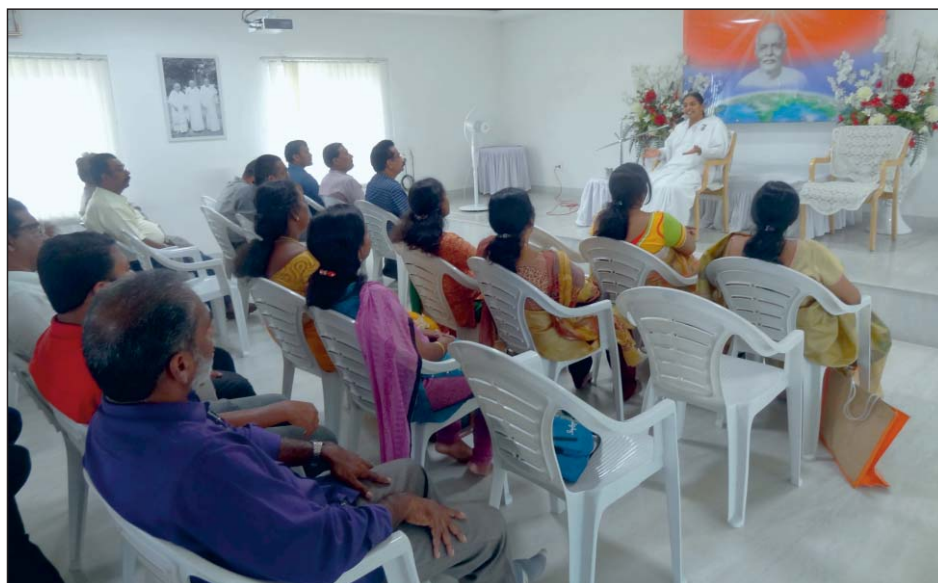
Visit to Brahma kumaris Institute, Hyderabad

The participants were practically involved in all sessions to improve their presentation skills. The programme was appreciated for its methodology which incorporated practical exercises, group discussions, simulations and management games. The participants were taken to Brahma kumaris Institute, Himayatnagar, Hyderabad to orient on work life balance for professional excellence. The participants felt that the training program is helpful to all