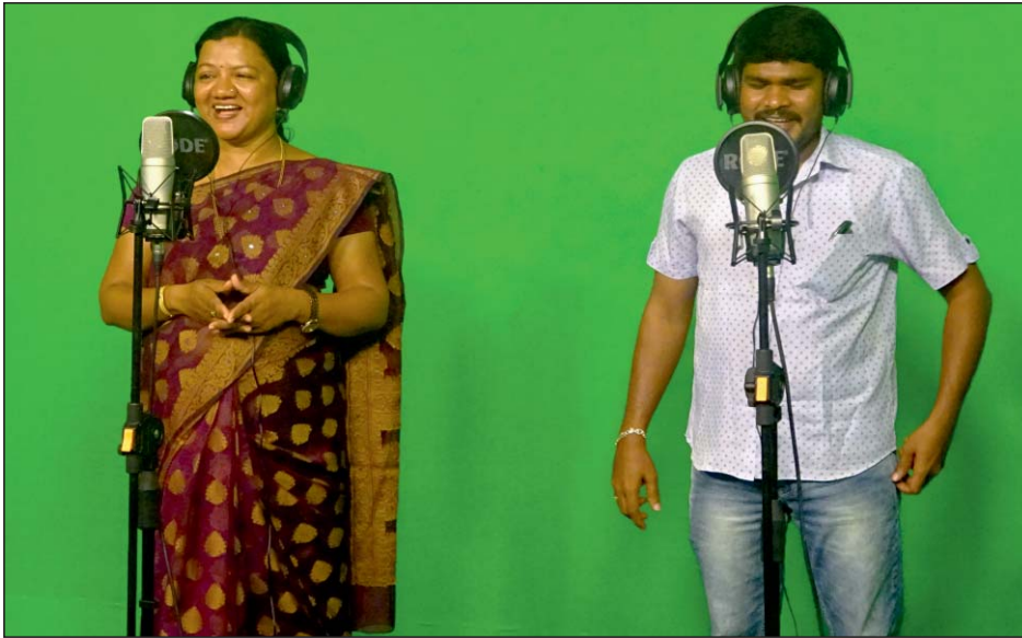
Trainees participation in recording at Electronic wing, PJTSAU