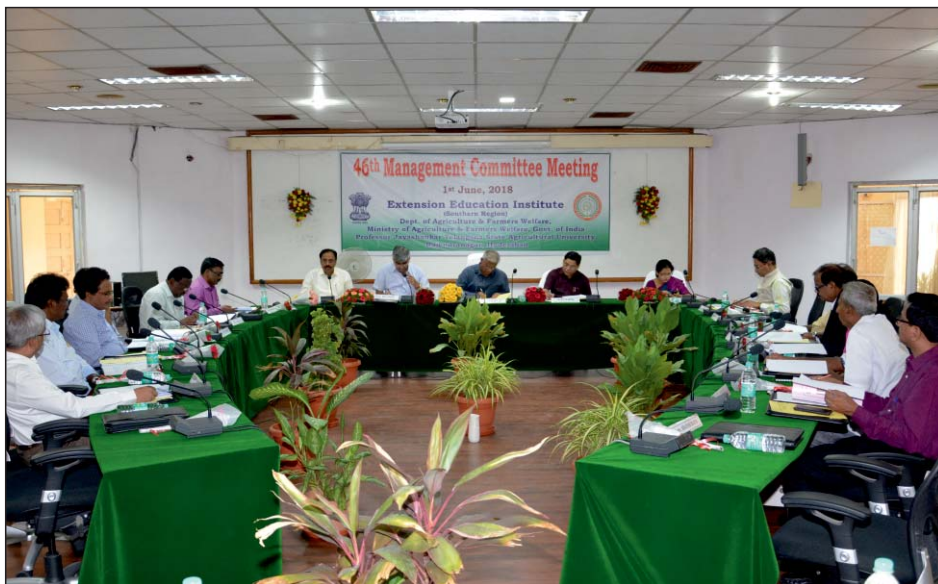
46 th Management Committee of EEI, Hyderabad

The permanent office bearers/ members of Management Committee included representatives of Directorate of Extension, Government of India, representatives from sister institutes like MANAGE, NAARM, NIRD, TSIPARD and representatives of SAMETIs from all client states. The other members are elected for a