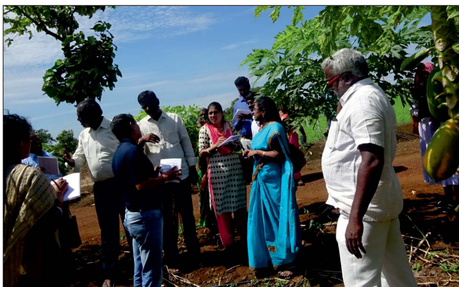
Visit to Kothagadi village, Vikarabad

Keeping the objective of making Extension professionals