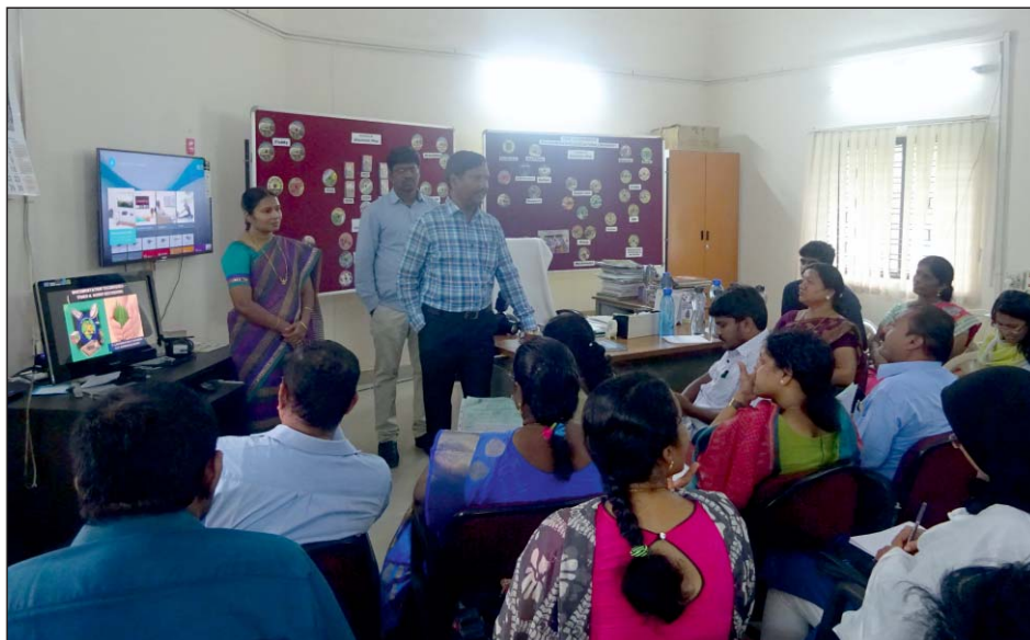
Trainees interaction at Electronic wing, Hyderabad.

speaking, public speaking skills etc. He further suggested the trainees to improve their knowledge by networking through whatsapp or facebook which inturn facilitates better service to farmers.